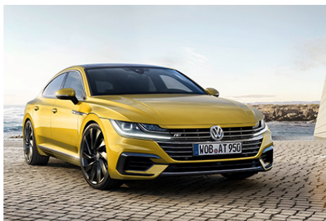
The new Arteon

Wolfsburg/ Geneva (CH) – The new Arteon is the highlight of this year's show appearance by the Volkswagen brand at the Geneva International Motor Show. Both elegant and dynamic, it offers a remarkable amount of space and comfort with its coupé-like lines. The newly developed fastback model has the latest generation driver assistance systems, which in the past have been reserved for higher car classes. In addition, the new Tiguan Allspace is making its debut at Lake Geneva – with much more space for luggage and up to seven passengers and impressive flexibility.