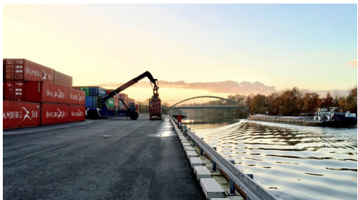
The CKD-Containerterminal in Fallersleben

The CKD approach may be adopted for a number of reasons; it may not be viable to build a factory in the country concerned, volumes may be too low for local production, the cost of new tooling for a local plant may be too high or customs and import regulations may call for this approach.